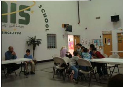
Right: Islamic quiz

Find us on the Web! www.myannoor.com Coming soon... Teachers' pages