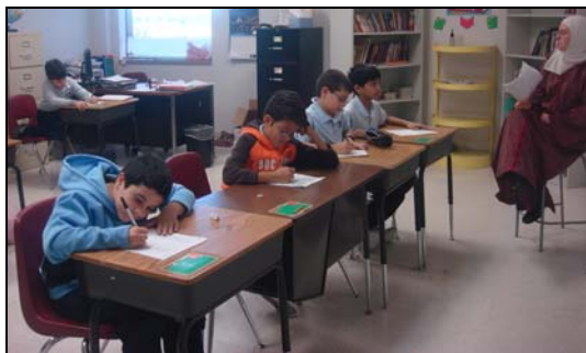
The 4th grade finishes their spelling test. This grade has to take the science, math and reading state assessment tests.

The state assessment tests will be in late March and early April. The IOWA tests will be in May and will include all grades from kindergarten through 8 th .