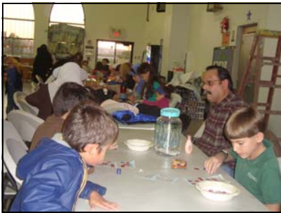
Above: BINGO night

There will be PTO meetings on Nov. 16 and 30 at 2 p.m. There will be a movie night from 6 to 8 p.m. on Nov. 18.