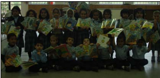
These are some of the books the kindergarten class earned when parents ordered books from Scholastic.

In language arts, they are learning double consonants. They are also on their third